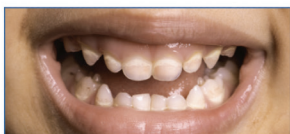
Chalky white spots