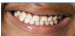
Normal healthy primary teeth

Social determinants of health can lead to a higher risk of dental disease. Left untreated, dental disease leads to pain and infection and can potentially affect social and emotional well-being, eating habits and missed school or work hours.